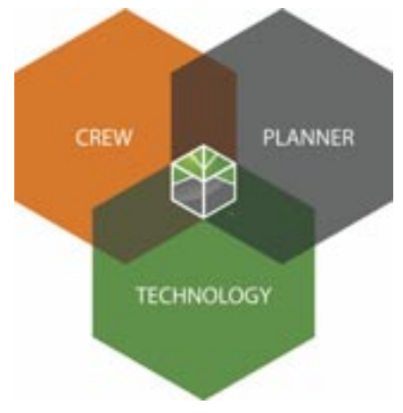
Figure 1: The Clearion solution is an example of a technology that utility managers can integrate into their program.

Skills are acquired with experience and time. Consider, for a moment,